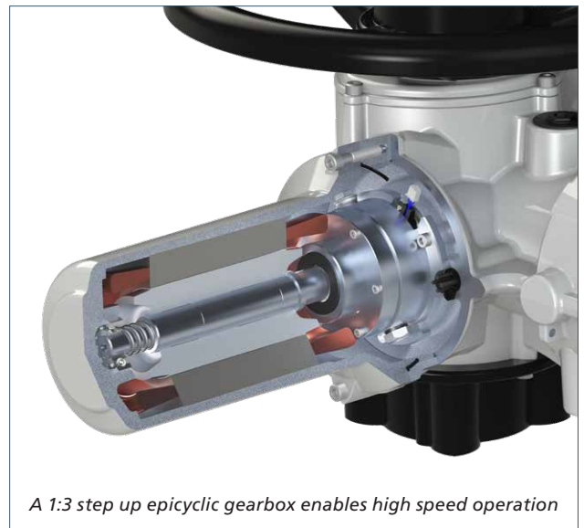
A 1:3 step up epicyclic gearbox enables high speed operation

IQH actuators have been developed for diverter valves in meter prover applications that require fast operation with positive seating and zero backdriving.